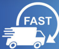
3-7 Days Swift Delivery