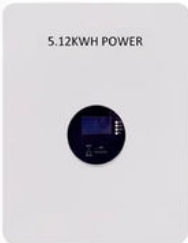
Solar LiFePO4 B5.12KW 51.2V 100Ah 200Ah atttery