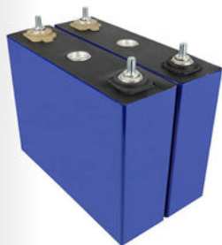
Lifepo4 battery 3.2V 304A