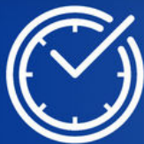
24 Hours Online Support