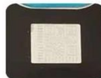
Complete QR Code