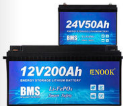
12V & 24V SERIES ENERGY STORAGE LITHIUM BATTERY